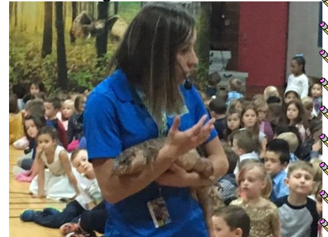
The students loved seeing the live animals, and learning what they could do to protect wildlife!