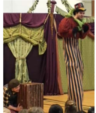
Hiding from the giant