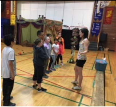
Back stage crew