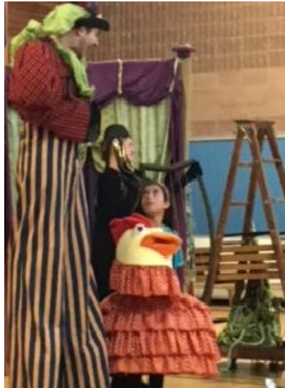
Chicken who lays the golden eggs