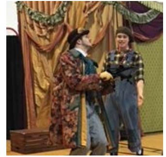
Here are some beans for your cow!