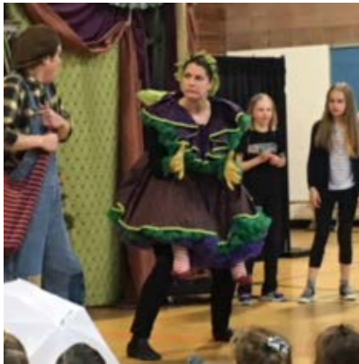
Jack's mom is not happy!