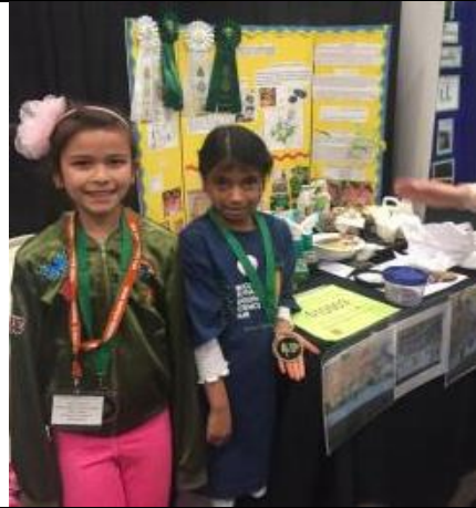
Wood Buffalo Science Fair

Facebook: École Dickinsfield School App: École Dickinsfield School