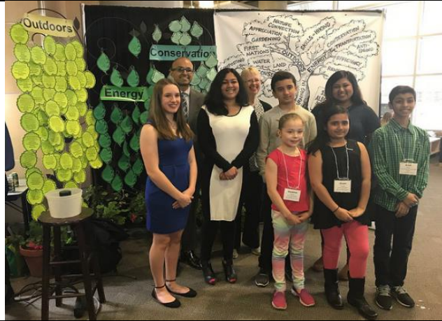
Alberta Council for Environmental Education in Edmonton