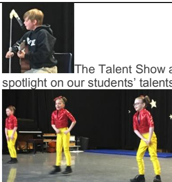
The Talent Show also shone the spotlight on our students' talents.

The diversity of our student population is another area to celebrate! At our Multicultural Fashion Show, the spotlight was on the many cultures represented in our school.